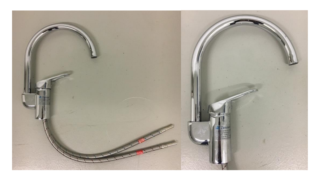
Figure 1. Measured kitchen faucet 10131.

The faucet consists of the body and the spout outlet. Water connection hoses are manufactured from PE-X-plastic tubes covered with metal twine. The faucet is connected to the water supply network with pressing coupling. Regulation of the faucet's water flow rate and temperature is performed with a single lever control. The measured faucet type is presented in figure 1. A technical drawing of the tested faucet type is shown in annex A.