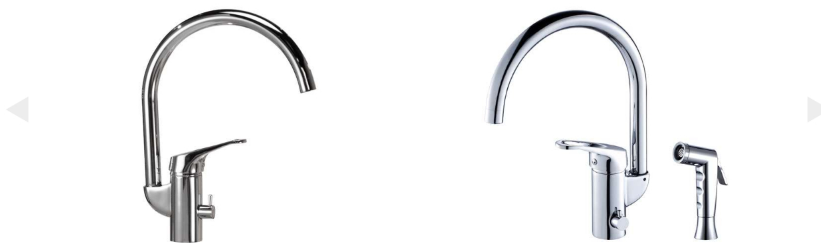
AGRION with dishwasher valve